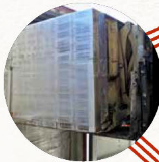
Unloading from container at destination