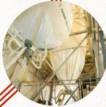
Onsite flour silos