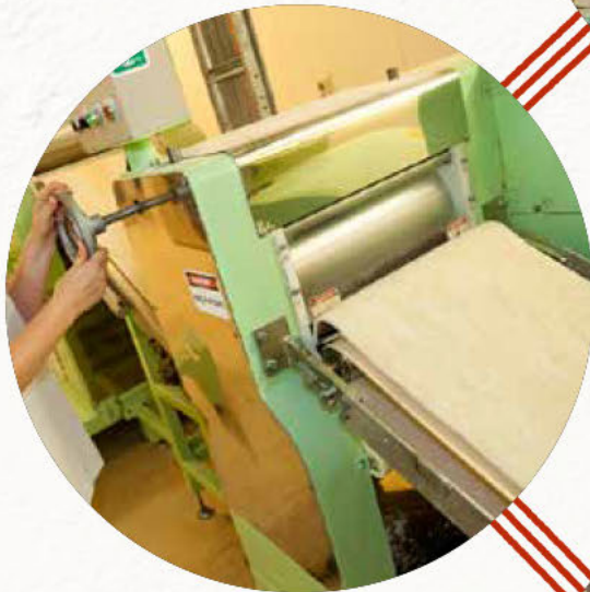
Rolling the noodle dough