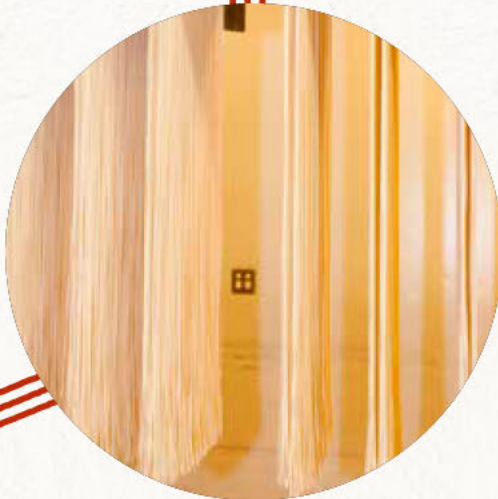
Noodle drying racks

Hakubaku Australia's Ballarat plant uses a unique, patented drying process which is the perfect combination of high temperature, humidity and time. The result is firm-textured, perfect noodles.