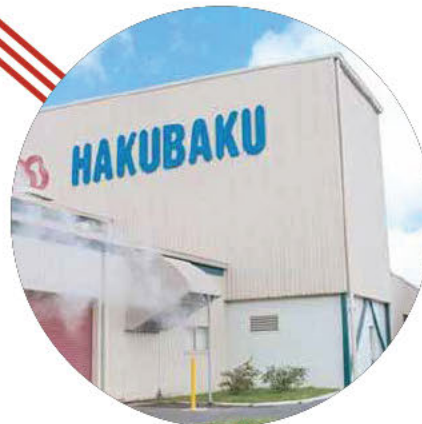
Arrival at Hakubaku Australia, Ballarat, VIC